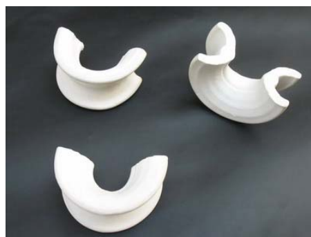
Fig 2. Ceramic Intalox Saddle -23