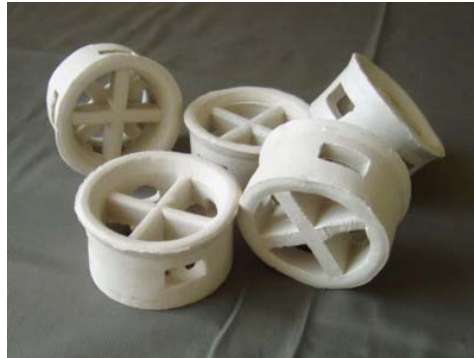
Fig 8. Ceramic Cascade Mini Ring -18