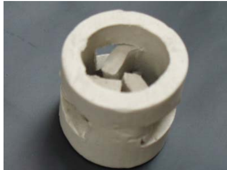
Fig 6. Ceramic Pall Ring -18