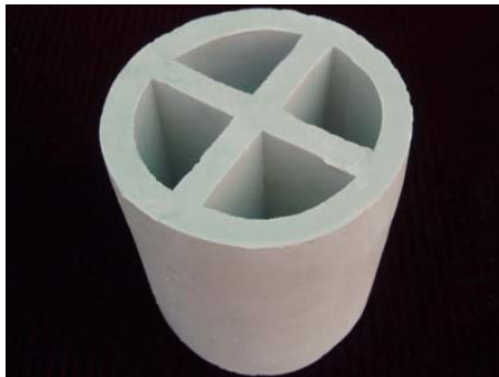
Fig 7. Ceramic Cross Partition Ring -18