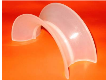
Fig 17. Plastic Saddle Ring