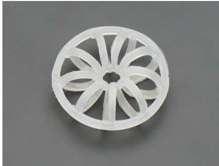
Fig 15. Plastic Rosette Ring