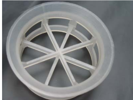
Fig 16. Plastic Cascade Mini Ring