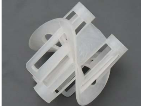
Fig 18. Plastic Heilex Ring