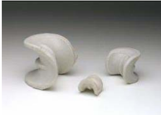
Fig 5. Ceramic Berl Saddle