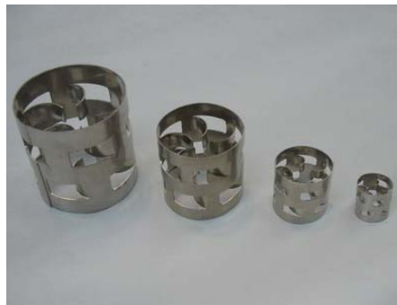
Fig 9. Metal Pall Ring

GMPR is one of the most common and well known packing, our Metal Pall Ring is an industry standard design media developed from the Raschig Ring and is used widely in all variety of applications. By minimizing the number of contours and crevices that can cause liquid hold-up and potential entrainment, the Metal pall ring geometry enables high gas and liquid transfer rates. The opened cylinder walls and inward bent protrusions of the Metal pall Ring allow greater capacity and lower pressure drop than standard cylindrical rings. This open ring design also maintains an even distribution and resists wall-channeling tendencies. The interior and exterior contacting surfaces of the Metal pall ring provide for an effective distribution of liquids and gasses and resist plugging, fouling and nesting. Pall rings are available in a wide range of materials.