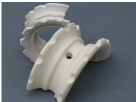
Fig 3. Ceramic Supper Saddle -18