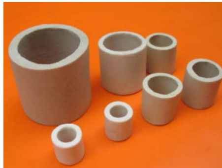
Fig 4. Ceramic Raschig Ring -18