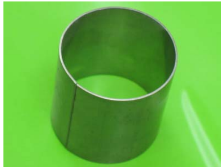
Fig 11. Metal Raschig Ring

Our Metal Raschig Ring is proven in a wide range of mass transfer applications. A full range of GMRR sizes and materials are available to tackle a wide range of separation applications. GMRR have a long history of improving separation efficiency. The simple big opening structure provides one of the largest surface areas among tower packing options. The advantages of metal raschig ring packing are high capacity, low pressure drop, high separation, cold and heat resistant, long life.