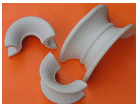
Fig 1. Ceramic Intalox Saddle -18

GCIS-23 (Ceramic saddles for RTO industry) is designed for longer life and increased performance in thermal shock conditions or continuous high-temperature environments. GCIS-23 is particularly suited for RTO's (Regenerative Thermal Oxidizers), the saddles are fired at 1200°C and exhibit greatly enhanced resistance to breakage from extreme thermal conditions. In addition, the new saddles possess higher levels of chemical resistance (even at very high temperatures), as well as superior wetting characteristics, high mechanical strength, and outstanding resistance to abrasion.