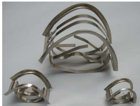
Fig 10. Metal Intalox Saddle

Our Metal Intalox Saddle is high performance random packing, successfully used in mass transfer towers both small and large diameter. It is frequently used in deep vacuum towers where low pressure drop is crucial and also high pressure towers where capacity significantly exceeds conventional trays, offer a 30% lower pressure drop than Pall Rings but with a lower liquid hold-up. Our Metal Intalox Saddles' physical shape permits maximum randomness and minimum alignment, Advanced design gives it (GMIS) a high rate of liquid film surface renewal producing a high mass transfer rate, leading to a greater capacity and efficiency compared to other random packings, Large number of contact points for homogenous distribution of liquid and gas, Facilitates shorter packed bed heights.