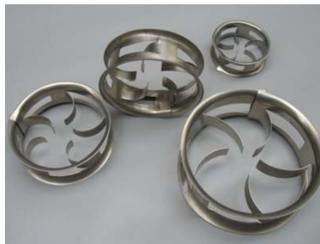
Fig 12. Metal Cascade Mini Ring

Our Metal Cascade Mini Ring, GM-CMR for short, a lower aspect ratio increases capacity and reduces pressure drop and the highly exposed internal and external surfaces give a high efficiency vehicle for liquid – gas contact with good mechanical strength. Lower aspect ratio (H/D 1/2 to 1/3) increase capacity and reduces pressure drop: GM-CMR's preferential orientation in a packed bed with the cylindrical axis in the vertical plane, allows a free passage for gas to flow through it. Smaller column size without sacrificing the efficiency: The lower pressure drop and higher throughput of GM-CMR enables a smaller column diameter and fan size to be specified in new installations, the highly exposed internal and external surfaces provide an efficient vehicle for liquid–gas contact, by multiple drip-points. More resistant to fouling: Because a combination of Metal Cascade Mini Rings' vertical alignment and open sides, allow any solids present to be flushed downwards through the packed bed. Good Mechanical Strength, which allows our Metal Cascade Mini Rings' use in deep packed beds that have a higher hydraulic capacity.