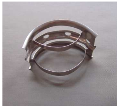
Fig 13. Metal Nutter Ring